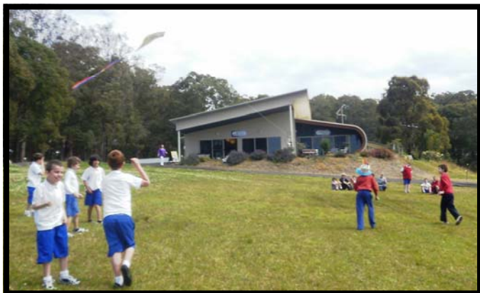
A great day was had by all!