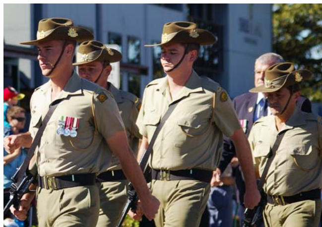
Servicemen marching at the Anzac Day Service

Students who are going to the Zone Cross Country tomorrow Thursday 3rd May will be departing from school at 9.20am. Students please make sure you wear blue shorts/skirt, white polo shirt and joggers. Please make sure your permission notes and money are into the office by 9.20am.