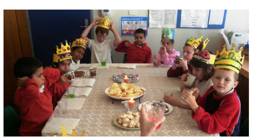
Both classes enjoyed the celebrations. Don't they look very regal.

SC2 and SC3 joined together and celebrated The Queen's Jubilee. Both classes made their own crowns and enjoyed some yummy high tea food.