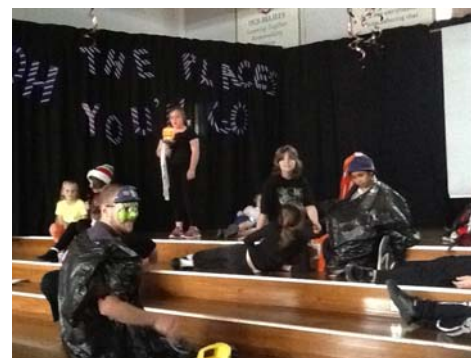
SCB Class Performance

Yesterday we held our annual school concert "Oh the Places You'll Go".... The students all looked wonderful and performed so well. Everyone had a marvellous day and the students just looked so amazing in all of their concert costumes which so much effort was put into by everyone involved. Below are some photos from the concert to share in these wonderful memories.