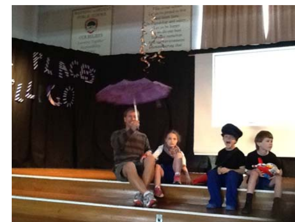
SCG Class Performance