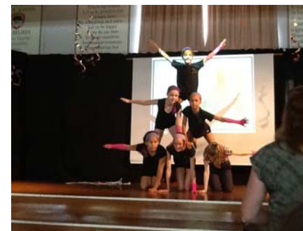
5/6C Class Performance