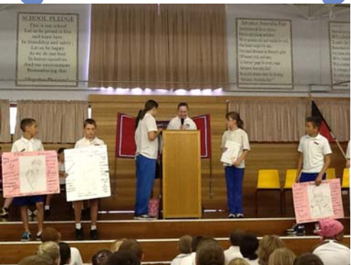
5/6C presenting their Assembly Item