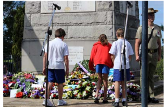
School Leaders presenting the Wreath