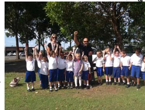
Kindergarten at the Eisteddfod