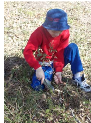
5/6C Cleaning up on National Tree Day