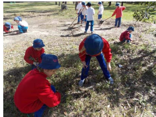
2/3 Students taking part in the Enviro Challenge

Three weeks ago, 2/3S signed up to take part in the Enviro Challenge. Every Friday the students have been working hard to transform an area of our playground into a lovely garden area that can be enjoyed by all. Each week participants send in progress updates and go in the running to win a prize. Well, all of 2/3S' hard work payed off last week, when we were picked! 2/3S are now the proud owners of a very special pairs of binoculars. This will hep us to monitor the birds that are attracted to our garden. The next major prize is a laptop!