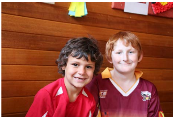
End of Term 3 disco, Wednesday 20 Sept.