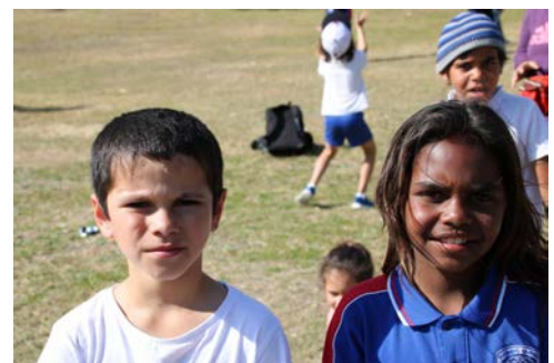
Touch Footy Afternoon, 22 Sept