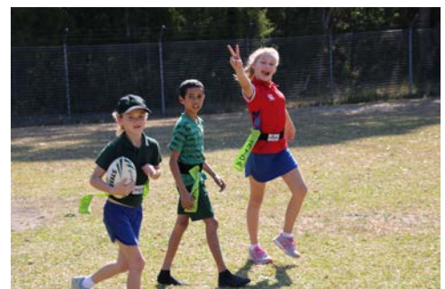
Touch Footy Afternoon, 22 Sept.