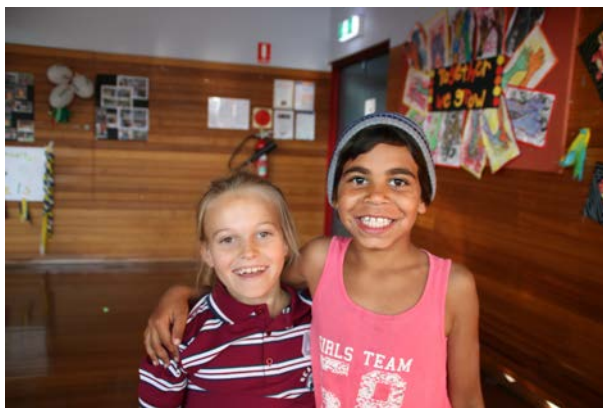
End of Term 3 disco, Wednesday 20 Sept.

Class teachers regularly teach these beliefs to their students. These beliefs link in with our positive behaviour for learning initiative, 'Buddies not Bullies'.