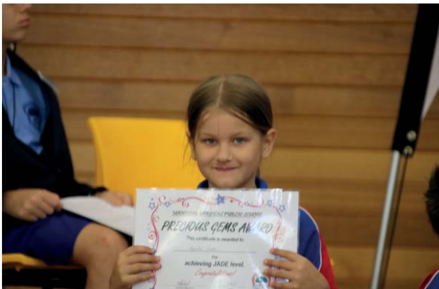
Precious gems awards are presented at our fortnightly school assemblies

We have three beliefs at Manning Gardens Public School. We expect everyone to follow these beliefs when they are on our school site. Our first belief is being safe. We want everyone to be safe on our school site. Students can stay safe at school by following all staff directions and using their hands and feet for helping. Our second school belief is being fair. Being fair is a general belief that ensures everyone is treated equitably and without bias. Being fair can be seen in the classroom when students take turns and respect the right of everyone to do their job. Our third school belief is being a learner. All students are learners and all staff are learners. Everyone is entitled to be a learner at school. We will protect this right of every student.