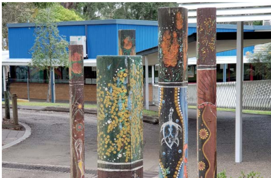
The original school belief totems near our main office

There are snakes everywhere at our school .... and we love it! No, not real snakes but beautiful counting snakes on the ground around our school.