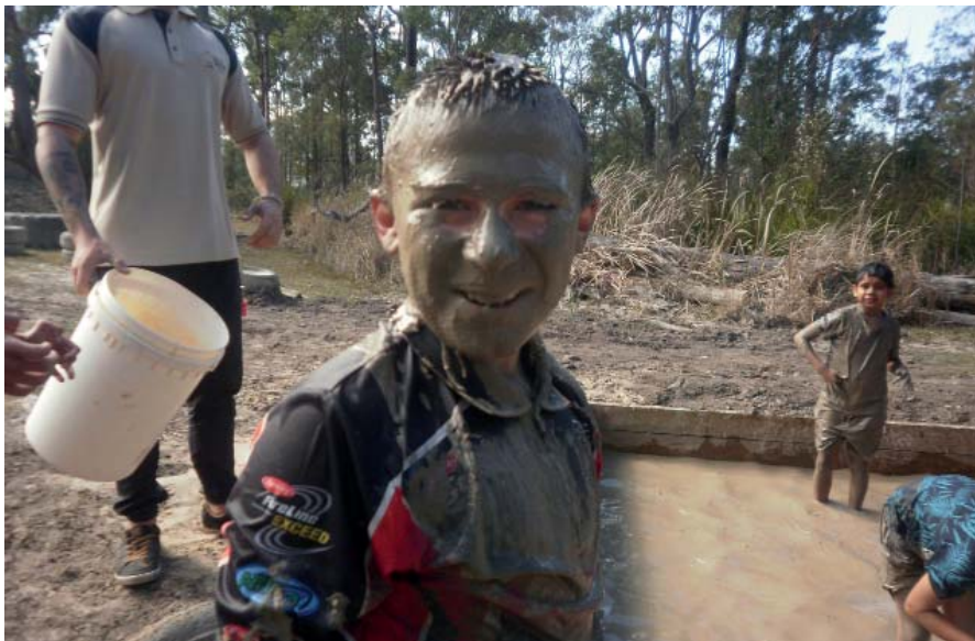
The mud pit at the Great Aussie Bush Camp

The senior camp doesn't just happen each year. It takes a team of school staff, many hours of their own time to organise the camp and get it just perfect. The staff who attend the camp also donate their own time and are away from their own family and friends for three days. Thank you Manning Gardens school staff!